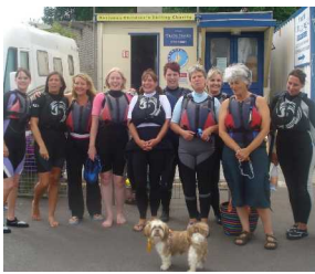
(Swimmers and Mascot get ready)

Teachers and supporters of Mount Tamar Special School all took to the water this month for a sponsored swim from Drakes island (St Nicholas Island – original name for the historians amongst us) all the