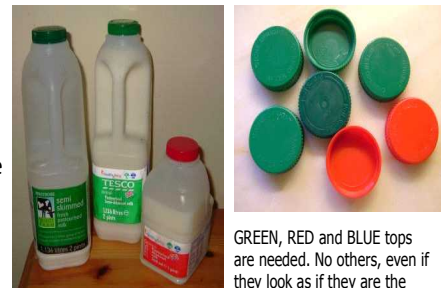
GREEN, RED and BLUE tops are needed. No others, even if they look as if they are the same sort of plastic!

We now have a storage area that we are filling with plastic bottle tops that will at some time (either as one load or many smaller loads) need to be taken to Portsmouth. If any of our supporters knows anyone that is involved in deliveries or regularly drives to Portsmouth with some empty space that can take a couple of Black bags for us can you please get them to contact Craig for further details.