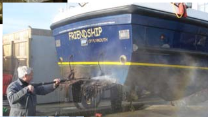
Right: St Jon and his lance banishing the foe!!