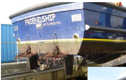
Left: Before the goodly Knight St Jon went to work with his trusty lance!

'H is for Hoist'. 1030 January 20th saw 'Friendship' lifted out of the water for the first time since her inaugural launch 18months ago for a mini service, scrub down, good hull inspection, antifouling and then back into the water.