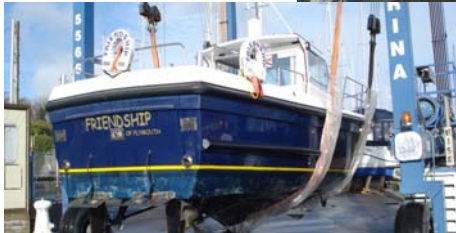
Left: All clean and awaiting the sun for the painting to happen!!