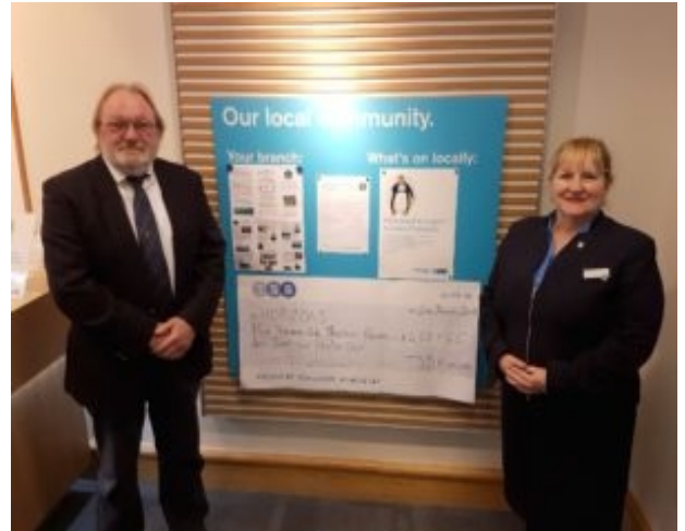
A BIG THANK YOU TO TSB FROM EVERYONE IN HORIZONS!

They are doing a fantastic job and have raised over £400 so far from a range of different activities involving their staff and customers.